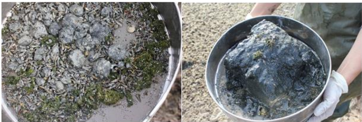
Figure 2: Sieved sediment from station 1 (left) and sediment from station 2 (right)

From each station two replicated samples were collected, using a Box Corer, of 0,03m 2 (Figure 2). The samples were sieved with sea water through a 1mm mesh, fixed in neutralized formalin (4%) and stained with Rose Bengal, so as to facilitate the sorting effort. Macroinvertebrates were sorted, identified to species level where possible (in a few cases a higher taxonomic level was used, due to the bad preservation of the animal and/or missing of important for the taxonomy parts of the body etc.), and counted.